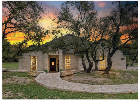
1053 Windmill Drive | Dripping Springs Buyer Represented