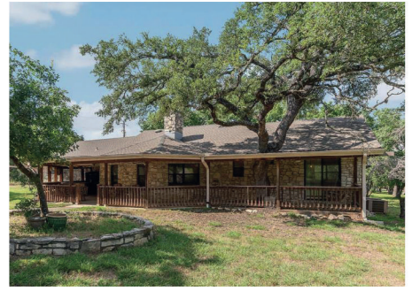
1103 N Canyonwood Drive | Dripping Springs Seller Represented