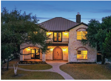
707 Blue Hills Drive | Dripping Springs Buyer Represented